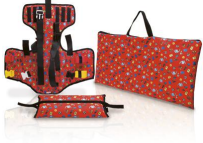
Med Ped 9120 Pediatric spinal immobilizer