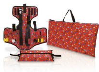
Med Ped 9120 Pediatric spinal immobilizer