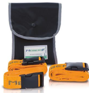
584 Black bag with 3 orange straps in 2 pcs and quick-release plastic buckle for Ergon stretcher