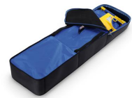
16150-001 Winch bag for Ergon