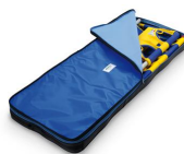
16150-002 Storage bag for Ergon stretcher