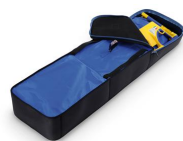
16150-001 Winch bag for Ergon