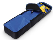
16150-001 Winch bag for Ergon