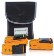
584 Black bag with 3 orange straps in 2 pcs and quick-release plastic buckle for Ergon stretcher