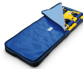
16150-002 Storage bag for Ergon stretcher