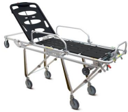
Winner 910 PROOF Self loading stretcher - certified