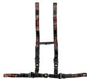
612/N-2/MEB Adjustable thoracic abdominal belt black with MeBer band with 4 points fastening for self loading stretchers and sedan chairs