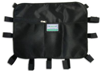
12025 Black multi usage object holder for automatic loading stretcher