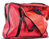
9100-011 Carrying bag for pediatric vacuum mattress