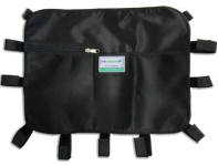
12025 Black multi usage object holder for automatic loading stretcher