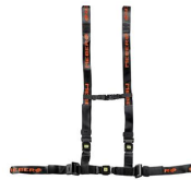
612/N-2/MEB Adjustable thoracic abdominal belt black with MeBer band with 4 points fastening for self loading stretchers and sedan chairs