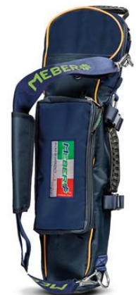
12072/BG "COVER OX 5 BG"- professional cylinder holder for 5 lt oxygen bottles