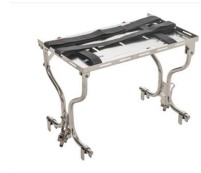
939 Instrument support for stretchers