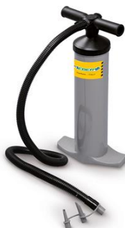
896/DF Abs aspiration pump