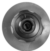
894-001 Aspiration valve for vacuum splints and mattress