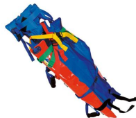
Bunny Plus 9102 Independent chambers vacuum mattress pediatric with integrated head immobilizer