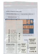
894-004 Repairing kit for Snake vacuum mattress