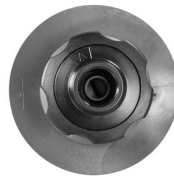
894-001 Aspiration valve for vacuum splints and mattress