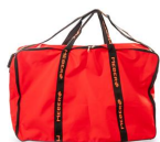
890-001 Carrying case for vacuum mattress