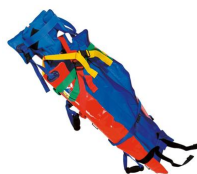
Bunny Plus 9102 Independent chambers vacuum mattress pediatric with integrated head immobilizer