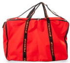
890-001 Carrying case for vacuum mattress