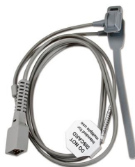
11208 Pediatric sensor for pulse oximeter Vital Test