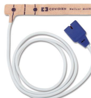
11212 Neonatal sensor for pulse oximeter Vital Test