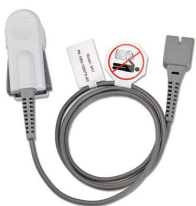
11206 Adult sensor for pulse oximeter Vital Test