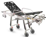
7265 Proof Aluminium self loading stretcher "Frog lite Advance" with extractable handles and Trendelenburg