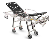
7265 Proof Aluminium self loading stretcher "Frog lite Advance" with extractable handles and Trendelenburg