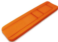
7013/A 3 pcs. Skay fire-proof electrowelded mattress