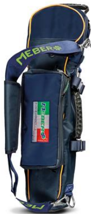
12072/BG "COVER OX 5 BG"- professional cylinder holder for 5 lt oxygen bottles