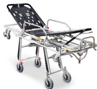
Frog Lite 7260 PROOF "FROG LITE" self loading aluminium stretcher with trendelenburg certified