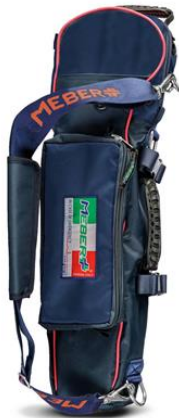
12072/BR "COVER OX 5 BR"- professional cylinder holder for 5 lt oxygen bottles