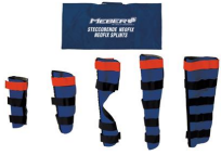
417 "NEOFIX" Neoprene splints set with case