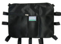
12025 Black multi usage object holder for automatic loading stretcher