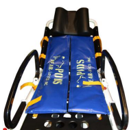
12154 "BEAR PODS" Bariatric containment system for self-loading stretchers