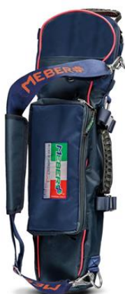
12072/BR "COVER OX 5 BR"- professional cylinder holder for 5 lt oxygen bottles