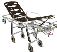
Frog 7240 PROOF "FROG PLUS" self loading stretcher with trendelenburg certified