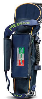
12072/BG "COVER OX 5 BG"- professional cylinder holder for 5 lt oxygen bottles