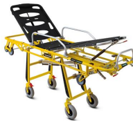
Frog 7210 "FROG" yellow self loading stretcher with trendelenburg