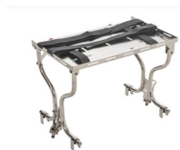
939 Instrument support for stretchers