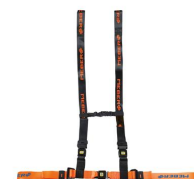
612/AN-2/MEB Adjustable thoracic abdominal belt orange/black with MeBer band and 4 points fastening for self loading stretchers and sedan chairs