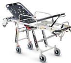
Mercury Lite 7080/4RG Proof Ambulance cot in aluminium with variable height and four swivel castors