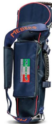
12072/BR "COVER OX 5 BR"- professional cylinder holder for 5 lt oxygen bottles