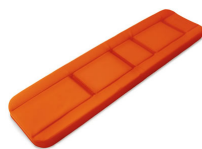
7014/A 4 pcs. Skay fire-proof electrowelded mattress