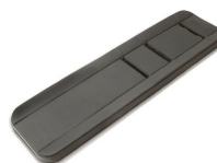
7013/N 3 pcs. Skay fire-proof electrowelded mattress