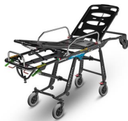
Mercury EL 7092 PROOF Certified self-loading stretcher