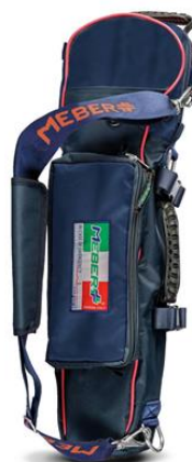
12072/BR "COVER OX 5 BR"- professional cylinder holder for 5 lt oxygen bottles