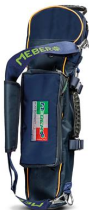
12072/BG "COVER OX 5 BG"- professional cylinder holder for 5 lt oxygen bottles