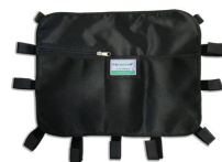
12025 Black multi usage object holder for automatic loading stretcher