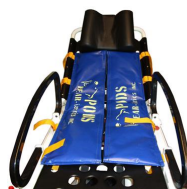
12154 "BEAR PODS" Bariatric containment system for self-loading stretchers