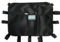
12025 Black multi usage object holder for automatic loading stretcher