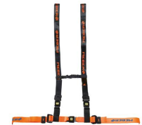
612/AN-2/MEB Adjustable thoracic abdominal belt orange/black with MeBer band and 4 points fastening for self loading stretchers and sedan chairs