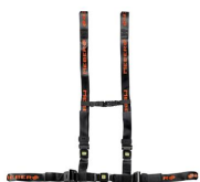
612/N-2/MEB Adjustable thoracic abdominal belt black with MeBer band with 4 points fastening for self loading stretchers and sedan chairs