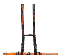
612/AN-2/MEB Adjustable thoracic abdominal belt orange/black with MeBer band and 4 points fastening for self loading stretchers and sedan chairs