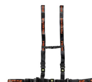
612/N-2/MEB Adjustable thoracic abdominal belt black with MeBer band with 4 points fastening for self loading stretchers and sedan chairs