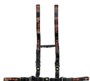
612/N-2/MEB Adjustable thoracic abdominal belt black with MeBer band with 4 points fastening for self loading stretchers and sedan chairs