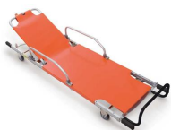
Fixed stretcher 1510 PROOF Fixed stretcher with nylon cover