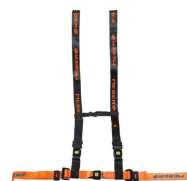
612/AN-2/MEB Adjustable thoracic abdominal belt orange/black with MeBer band and 4 points fastening for self loading stretchers and sedan chairs