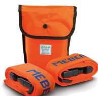
604/MEB Orange bag with 2 straps with plastic buckle and ME.BER. ribbon