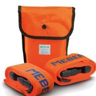
604/MEB Orange bag with 2 straps with plastic buckle and ME.BER. ribbon