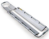
Maxima 631 Grey anodized anti trauma scoop stretcher with head/trunk in 1 pc