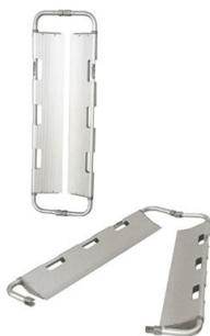
Maxima 6200 Pediatric anti trauma scoop stretcher