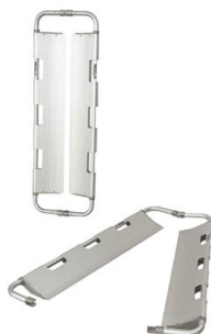
Maxima 6200 Pediatric anti trauma scoop stretcher