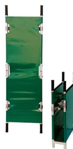
6100 Long folding stretcher