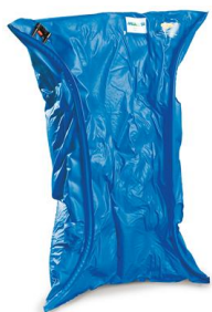
6300/B Vacuum mattress for veterinary use