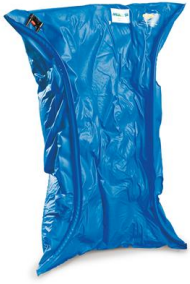
6300/B Vacuum mattress for veterinary use