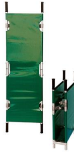
6100 Long folding stretcher