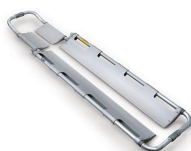
Maxima 631 Grey anodized anti trauma scoop stretcher with head/trunk in 1 pc