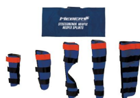
417 "NEOFIX" Neoprene splints set with case