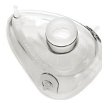
2404 Silicone reanimation mask size 4