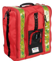
1366 Red knapsack "115" with side pockets and compartments COMPLETE