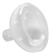
2402 Silicone reanimation mask size 2