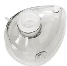
2403 Silicone reanimation mask size 3