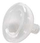
2401 Silicone reanimation mask size 1