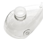
2405 Silicone reanimation mask size 5