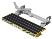
DynaStep 19302 800 mm mechanical step DynaStep