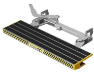
DynaStep 19300 1120 mm mechanical step DynaStep