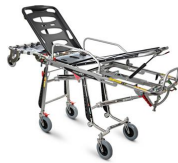
Mercury 7070/4RG PROOF Stainless steel variable height stretcher certified with 4 rotating wheels