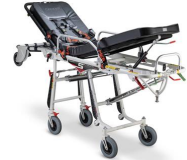
Mercury Lite Cinque 7095/4RG Proof Certified aluminium 5 levels self-loading stretcher with 4 swivel wheels