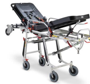
Mercury Lite Cinque 7095/4RG Proof Certified aluminium 5 levels self-loading stretcher with 4 swivel wheels