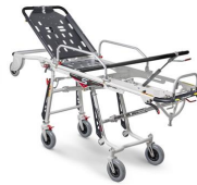
Mercury Lite Cinque 7095/4RG Proof Certified aluminium 5 levels self-loading stretcher with 4 swivel wheels