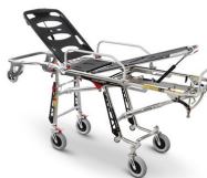
Mercury 7070/4RG PROOF Stainless steel variable height stretcher certified with 4 rotating wheels