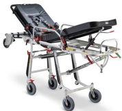
Mercury Lite Cinque 7097/4RG Proof Certified aluminium 5 levels self-loading stretcher with 4 swivel wheels - high version