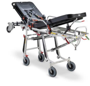
Mercury Lite Cinque 7095/4RG Proof Certified aluminium 5 levels self-loading stretcher with 4 swivel wheels