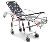
Mercury Lite 7080/4RG Proof Ambulance cot in aluminium with variable height and four swivel castors