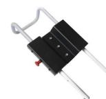
12128 Adjustable system for headrest of Meber-X and Mercury stretchers