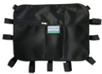
12025 Black multi usage object holder for automatic loading stretcher