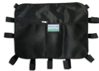
12025 Black multi usage object holder for automatic loading stretcher