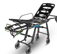
Mercury EL 7092 PROOF Certified self-loading stretcher