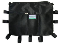
12025 Black multi usage object holder for automatic loading stretcher