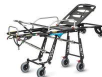
Mercury EL 7092 PROOF Certified self-loading stretcher