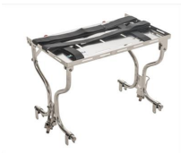
939 Instrument support for stretchers