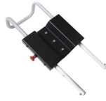
12128 Adjustable system for headrest of Meber-X and Mercury stretchers