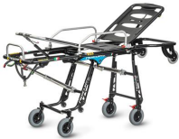
Mercury EL 7092 PROOF Certified self-loading stretcher