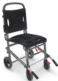
678 Extra Lite Basic Extra Lite Basic, foldable carrying chair