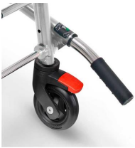
172J Removable right lever with ergonomic handle for Extra chairs