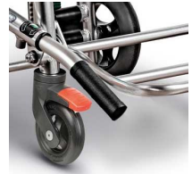
171J Removable left lever with ergonomic handle for Extra chairs.