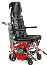
Extra Ergolift FX 675 Fixed frame powered Stair Chair suitable for transportation