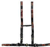
612/N-2/MEB Adjustable thoracic abdominal belt black with MeBer band with 4 points fastening for self loading stretchers and sedan chairs