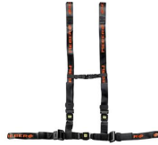
612/N-2/MEB Adjustable thoracic abdominal belt black with MeBer band with 4 points fastening for self loading stretchers and sedan chairs