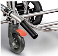
171J Removable left lever with ergonomic handle for Extra chairs.