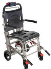
Extra Ergolift 671 Powered stair chair