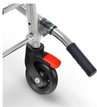
172J Removable right lever with ergonomic handle for Extra chairs