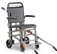
Extra 670/BR Track assisted stair chair with arms