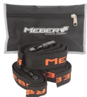
566 Black bag with 3 belts in 2 pieces made of black ribbon with orange MeBer logo for Extra chairs