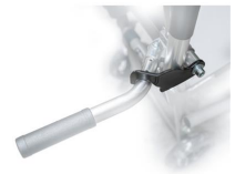
842L Zena rear levers locking kit