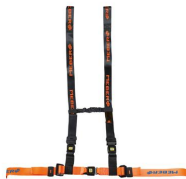
612/AN-2/MEB Adjustable thoracic abdominal belt orange/black with MeBer band and 4 points fastening for self loading stretchers and sedan chairs