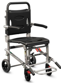
Extra Lite Standard 676 Foldable carrying chair with 4 wheels, footrest and arms