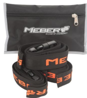
566 Black bag with 3 belts in 2 pieces made of black ribbon with orange MeBer logo for Extra chairs