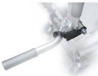
842L Zena rear levers locking kit