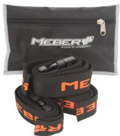
566 Black bag with 3 belts in 2 pieces made of black ribbon with orange MeBer logo for Extra chairs