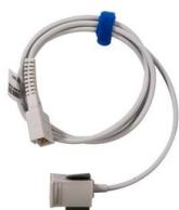
11224 Pediatric sensor for Oxytest