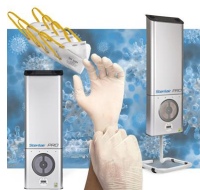
Prevention and individual protection