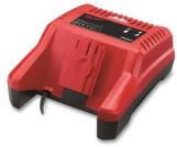
12090 Battery charger MILWAUKEE M28C for rechargeable battery M28 RED Extra Ergolift chair