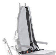
610 Thoracic-abdominal belt with four fastening for padded chair