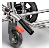
171J Removable left lever with ergonomic handle for Extra chairs.