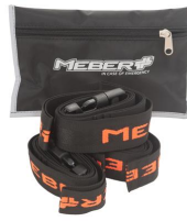
566 Black bag with 3 belts in 2 pieces made of black ribbon with orange MeBer logo for Extra chairs