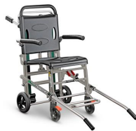
Extra 670/BR Track assisted stair chair with arms