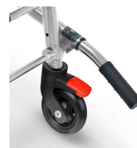
172J Removable right lever with ergonomic handle for Extra chairs