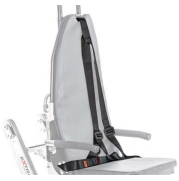
610 Thoracic-abdominal belt with four fastening for padded chair