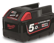
12092 Battery MILWAUKEE M28 RED 5,0 Ampere for Extra Ergolift chair