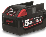
12092 Battery MILWAUKEE M28 RED 5,0 Ampere for Extra Ergolift chair