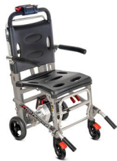
Extra Ergolift 671 Powered stair chair