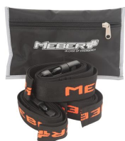
566 Black bag with 3 belts in 2 pieces made of black ribbon with orange MeBer logo for Extra chairs