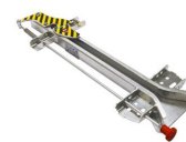
988 Integrated control fastening system for Extra Ergolift FX and Proxima Pro chairs (optional)