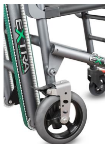
670-004 Castor with brake diam. 200 mm for Extra chair