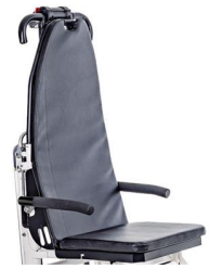
12118 Mattress for Extra and Ergolift chairs' transformation kit into fixed chairs