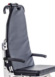
12118 Mattress for Extra and Ergolift chairs' transformation kit into fixed chairs