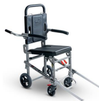
679 Narrow foldable sedan chair