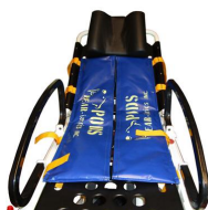
12154 "BEAR PODS" Bariatric containment system for self-loading stretchers