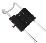
12128 Adjustable system for headrest of Meber-X and Mercury stretchers