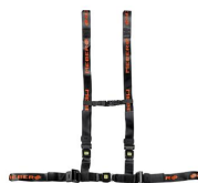
612/N-2/MEB Adjustable thoracic abdominal belt black with MeBer band with 4 points fastening for self loading stretchers and sedan chairs