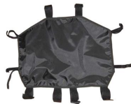
12122 Objects holder black for loading trolley of Meber-X stretcher