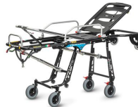
Mercury EL 7092 PROOF Certified self-loading stretcher